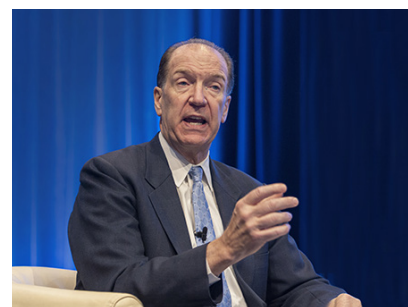
World Bank President David Malpass