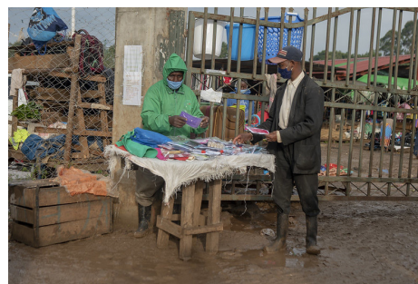
A mask seller and buyer in Kenya, April 2020

The World Bank (WB) and the International Monetary Fund (IMF) are supporting the DSSI implementation through monitoring and significant positive net transfers to eligible countries. The WB and IMF are supporting the DSSI through monitoring spending, enhancing public debt transparency and supporting prudent borrowing. More information here .