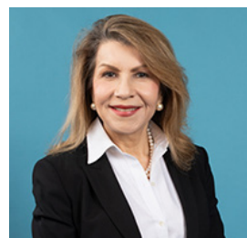
World Bank Vice President Carmen Reinhart

Carmen Reinhart, World Bank Vice President and Chief Economist writes that the global COVID-19 pandemic has resulted in soaring infection rates, widespread lockdowns, record-shattering declines in output, and spiking poverty. But, in addition to these trends, a quieter crisis now gaining momentum could jeopardize economic recovery prospects for years to come. More information here .